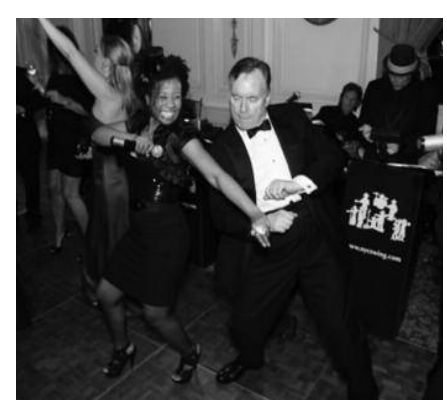
Dancing the night away with the band