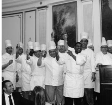
All the Kitchen Staff raise their glass to a job well done