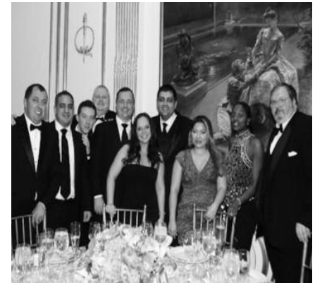
All the Staff of the New York Sheraton and Towers